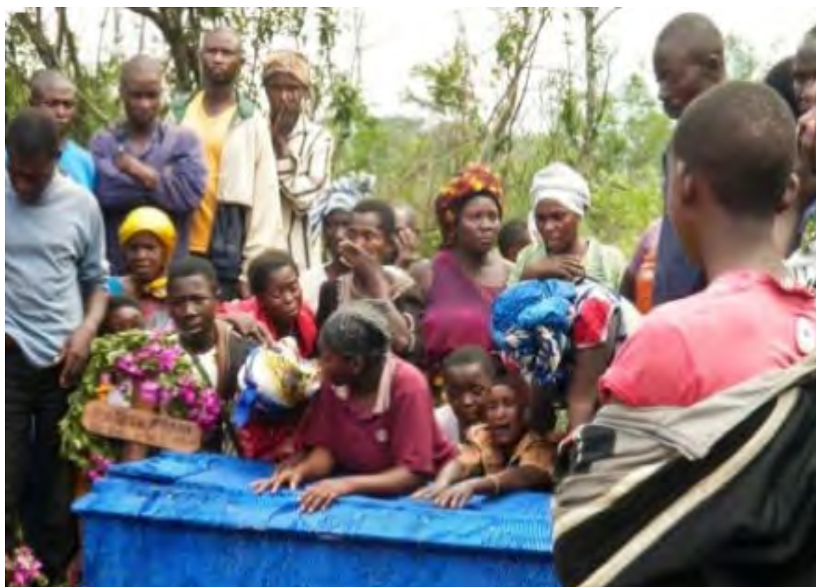
Families of the slain grieving

To support these families please go to www.thingreenline.org.au/donation